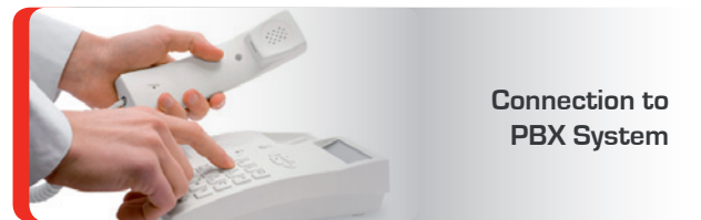
Connection to PBX System