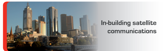
In-building satellite communications